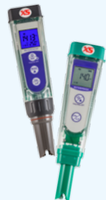
pH-COND-PC-ORP waterproof tester