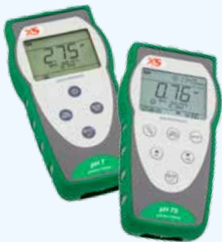
pH Series pH 7 - pH 70

Full line of waterproof portable and tester meters for pH, Conductivity and ORP in field measurement.