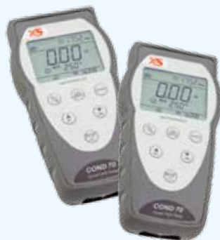
Conductivity Series COND 7 - COND 70