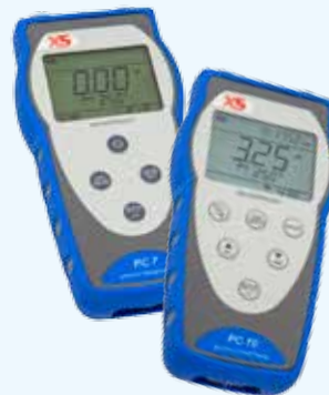
Multiparameter Series PC 7 - PC 70