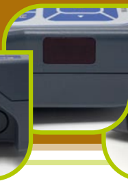
External Power Input