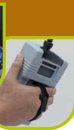
Velcro Strap for Firmer Grip