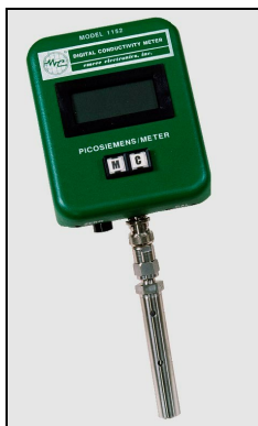
Model 1152 Meter